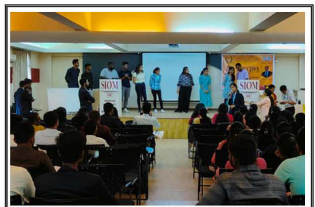
ICE BREAKING ACTIVITIES