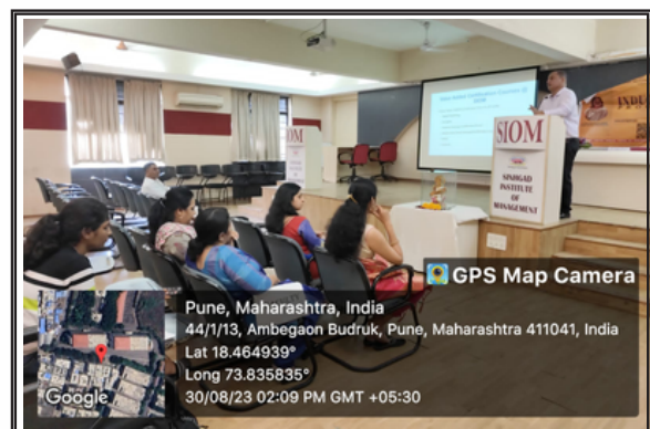
VALUE ADDED COURSES

The session was then followed by ice breaking sessions.